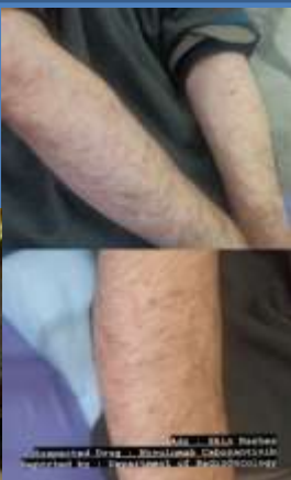
Multiple Scaly Keratotic Plaque